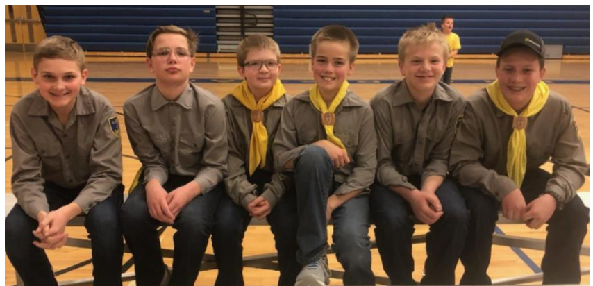
6th Grade boys